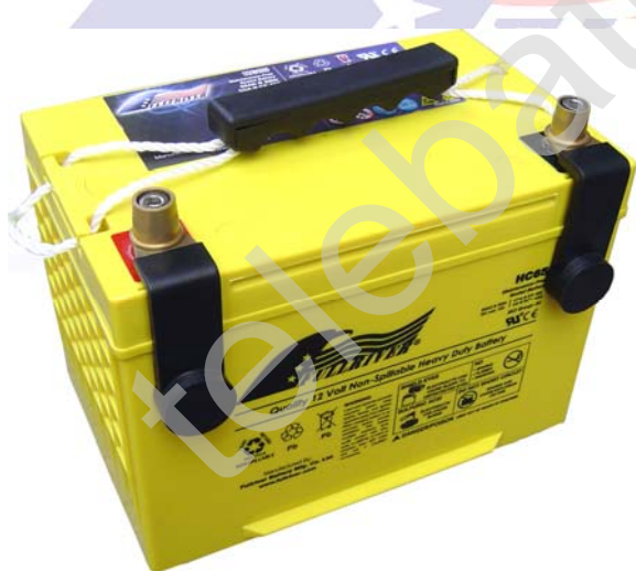
Battery Model: HC65/ST Battery Terminal: ST (M8 Button terminal fitted with TP28 brass automotive terminal and Side terminal)