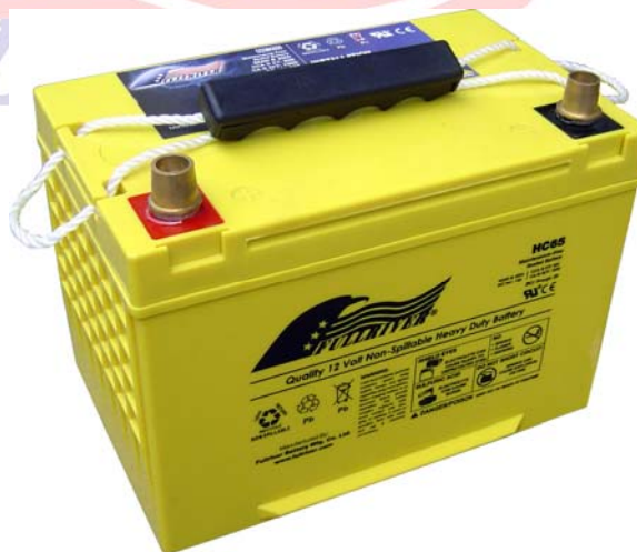
Battery Model: HC65/T Battery Terminal: T (M8 Button terminal fitted with TP28 brass automotive terminal)