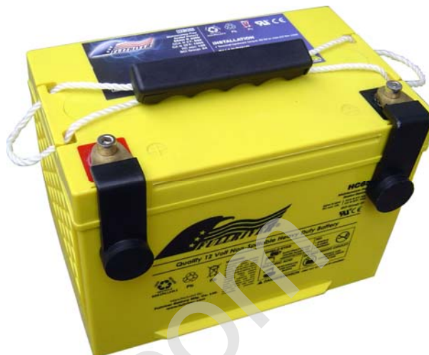
Battery Model: HC65/S Battery Terminal: S (M8 Button terminal Fitted with side terminal)